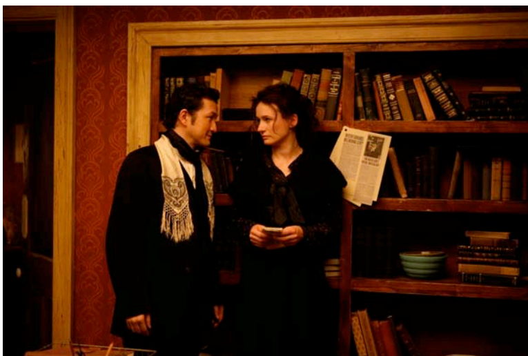
Shidô Nakamura and Emily Mortimer