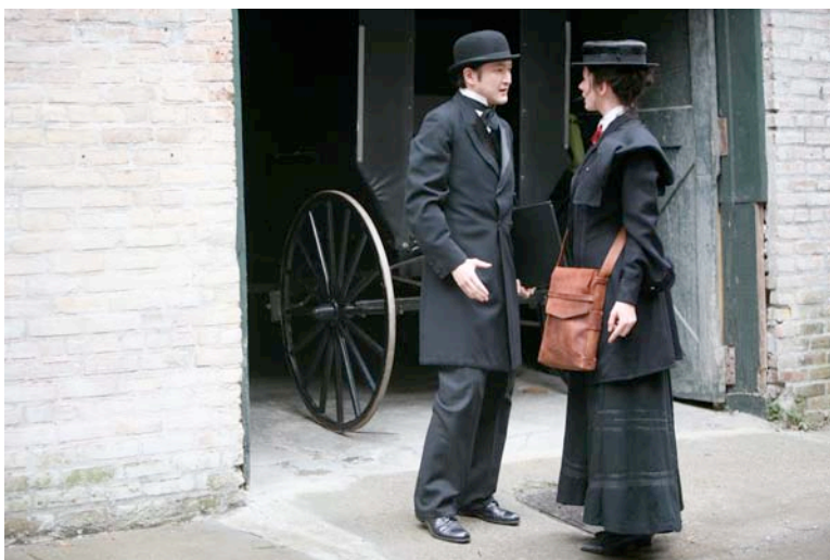
Shidô Nakamura as Yone Noguchi and Emily Mortimer