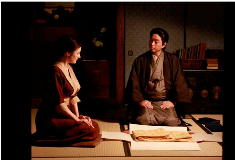
Emily Mortimer and Masatoshi Nakamura as Toshu Senda