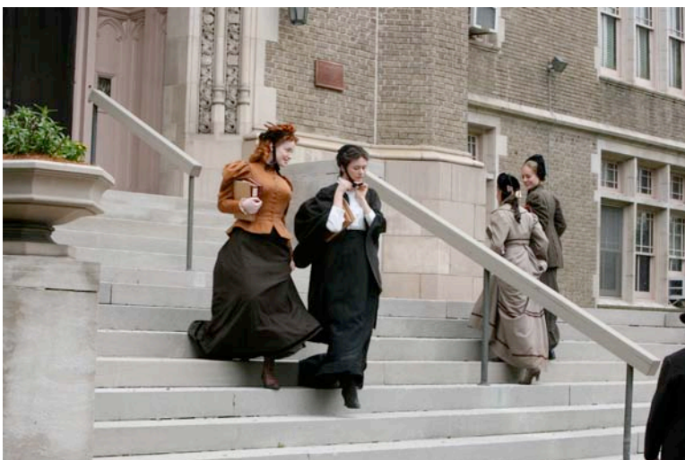
Christina Hendricks and Emily Mortimer