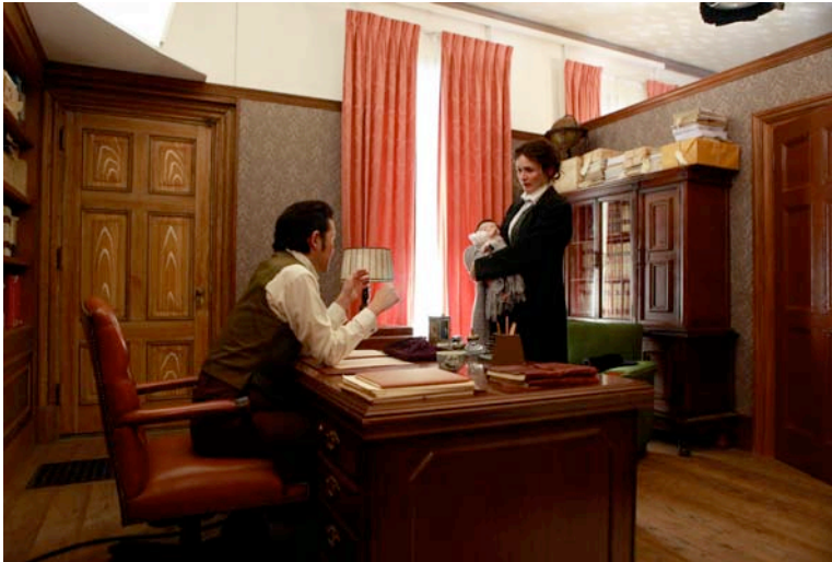
Shidô Nakamura and Emily Mortimer