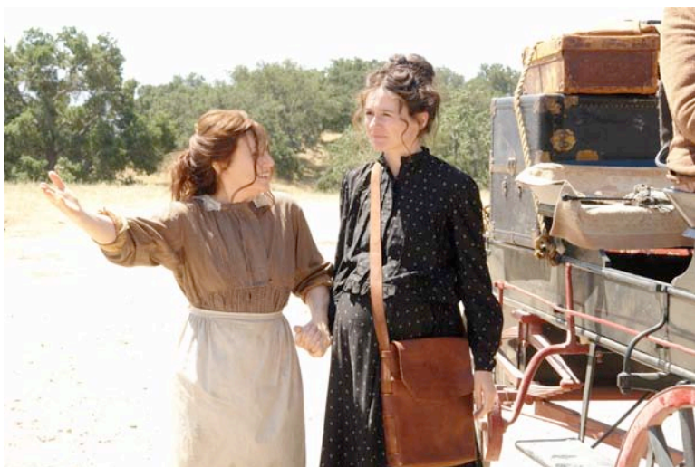
Mary Kay Place as Albiana and Emily Mortimer