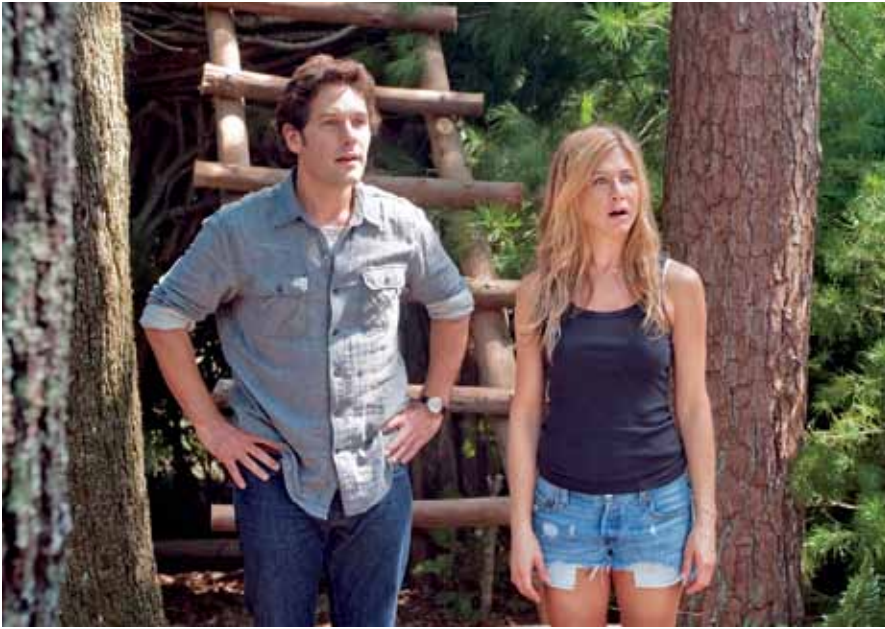
The guests don't know what to make of what they're seeing.