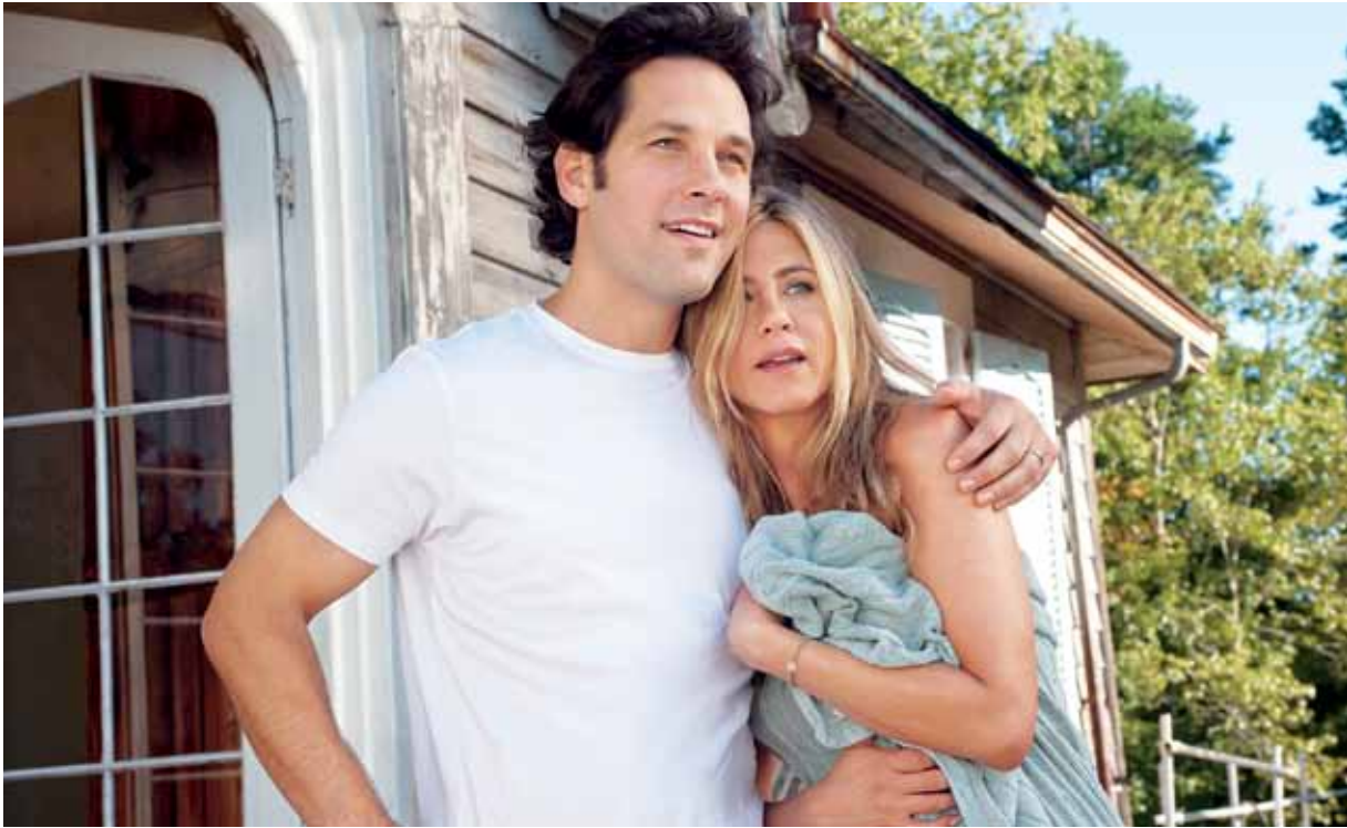
George (PAUL RUDD) and Linda (JENNIFER ANISTON) find their new home in the comedy Wanderlust .