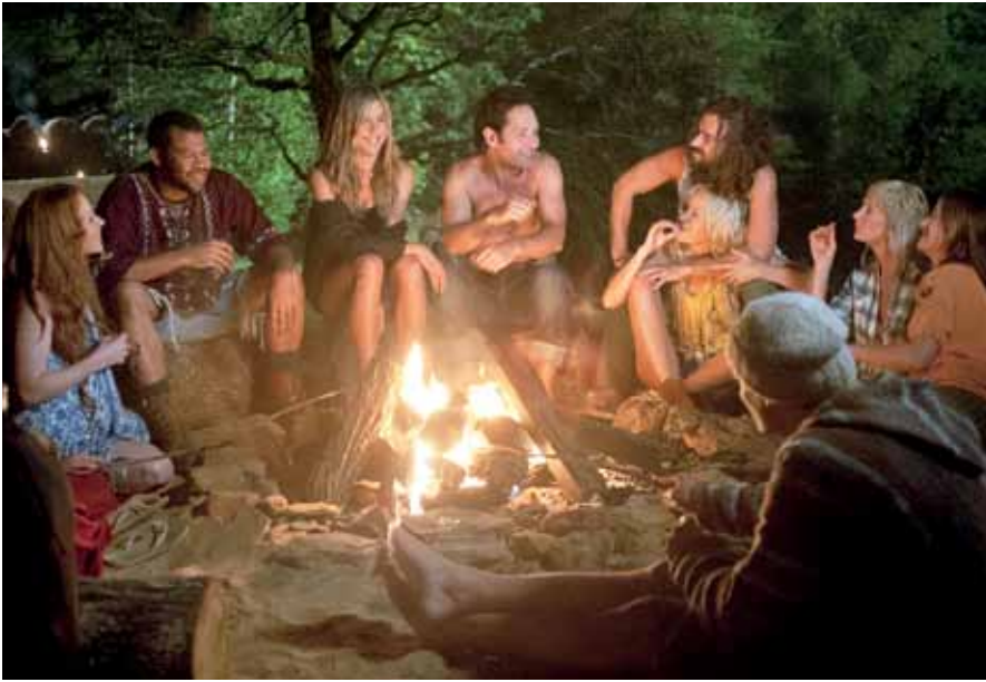
(Clockwise) Almond (LAUREN AMBROSE), Rodney (JORDAN PEELE), Linda, George, Seth, Eva, Kathy and Karen swap stories.