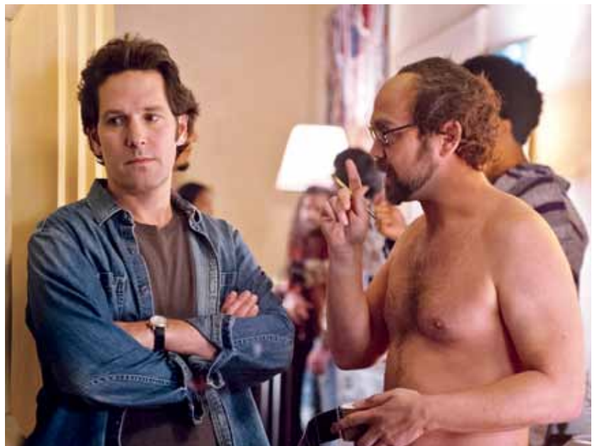
George tries not to look directly at nudist Wayne (JOE LO TRUGLIO).

With Rudd and Aniston in place, Wain and Marino approached Judd Apatow to join them in production duties. The filmmaker has worked with Rudd on several comedies including The 40-Year-Old Virgin , Knocked Up and Forgetting Sarah Marshall , as well as Apatow's upcoming This Is 40 . "Judd was the natural person to seek out for this project," says Wain. "I've known him loosely over the years because we've worked with a lot of the same people, particularly Paul. Our sensibilities overlap, and he brings an unmatched depth of experience