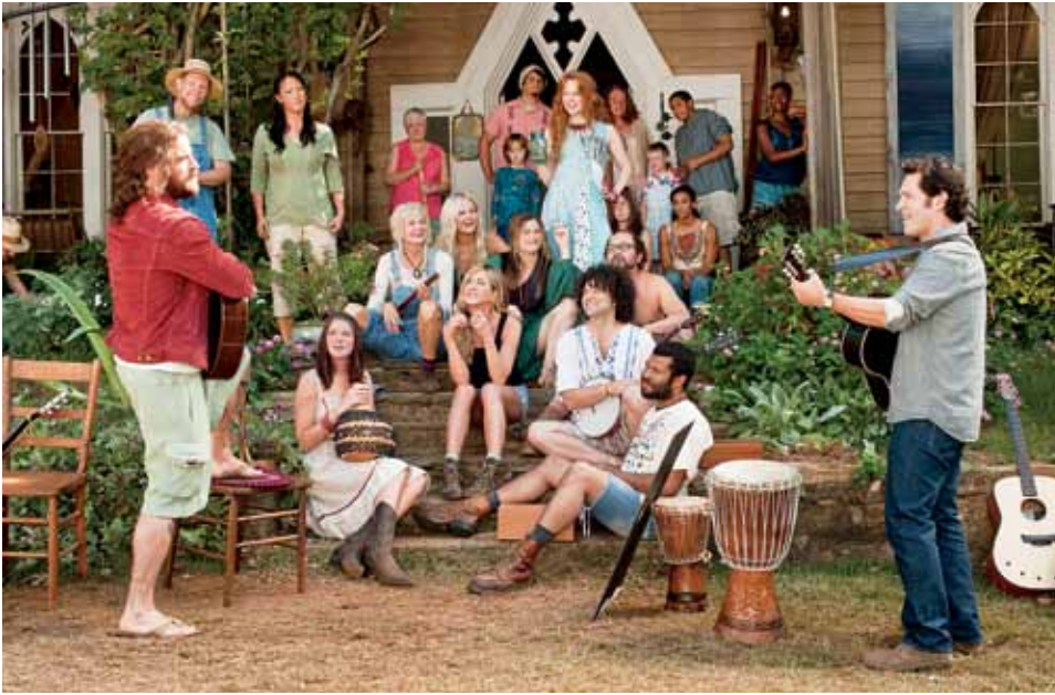
Elysium's alpha male, Seth (JUSTIN THEROUX), and George jam for the crowd.

Wayne; KERRI KENNEY-SILVER ( Role Models ) as the boundaryless Kathy; KATHRYN HAHN ( Anchorman: The Legend of Ron Burgundy ) as former porn star and current jam maker Karen; LAUREN AMBROSE (TV's Six Feet Under ) as Earth mother Almond; and JORDAN PEELE ( Little Fockers ) as Almond's life partner, Rodney—who embrace a refreshingly different way of looking at things. After spending one adventurous night among these characters, George and Linda decide to give a new lifestyle a go and begin to question how they should live the rest of their lives.