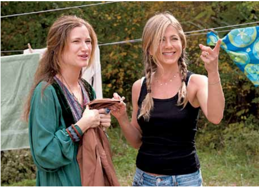
Former adult-film star Karen (KATHRYN HAHN) gives advice to Linda.

in laying bare the emotional spine of a comedic story. I'd always hoped to work with him at some point, and this project seemed like the perfect fit."