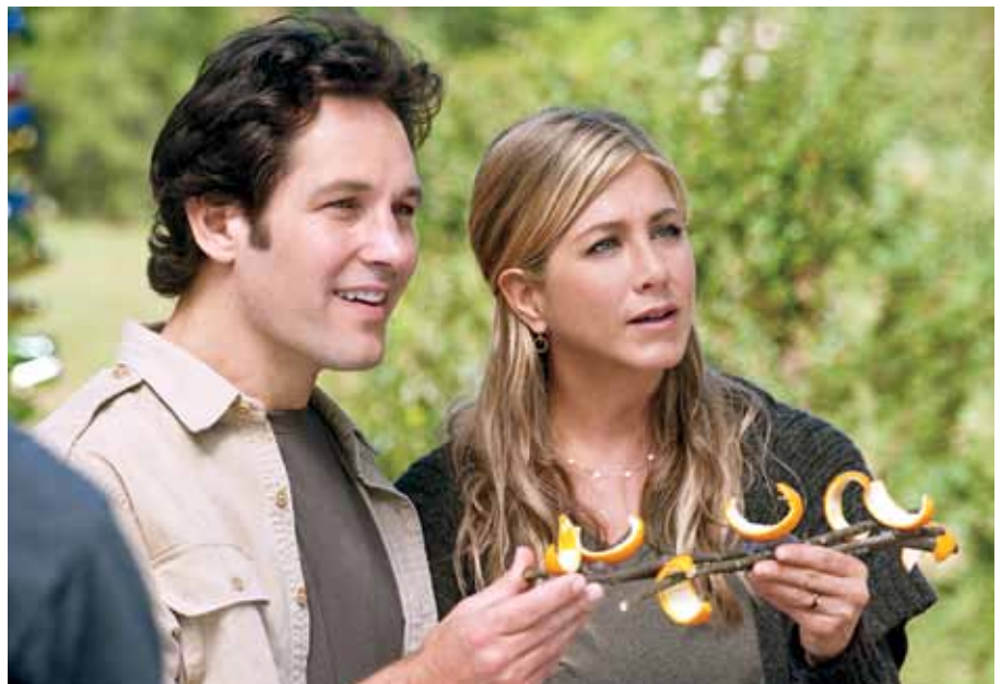
The New Yorkers accept a very strange gift.

Akerman felt comfortable with her team and easily slipped into character. She shares: “It has been such a pleasure working with everyone. To be surrounded by these amazing actors, whom I cherish, well, I couldn’t have asked for a better situation.”