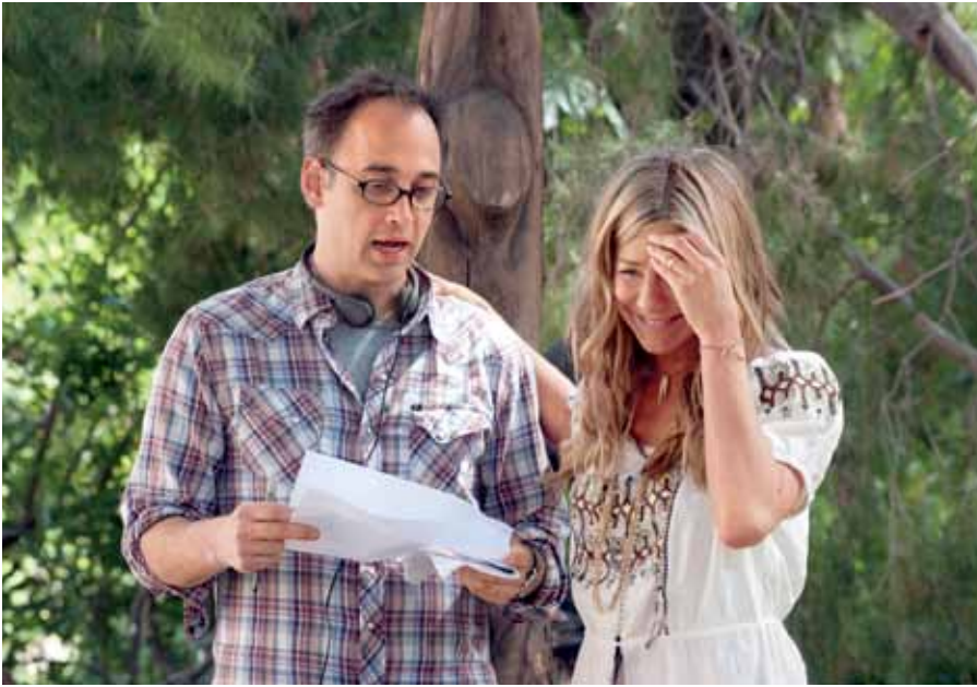
Director DAVID WAIN and JENNIFER ANISTON as Linda on the set.