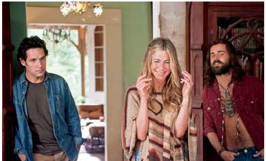
George isn't as thrilled at Elysium as Linda and Seth.