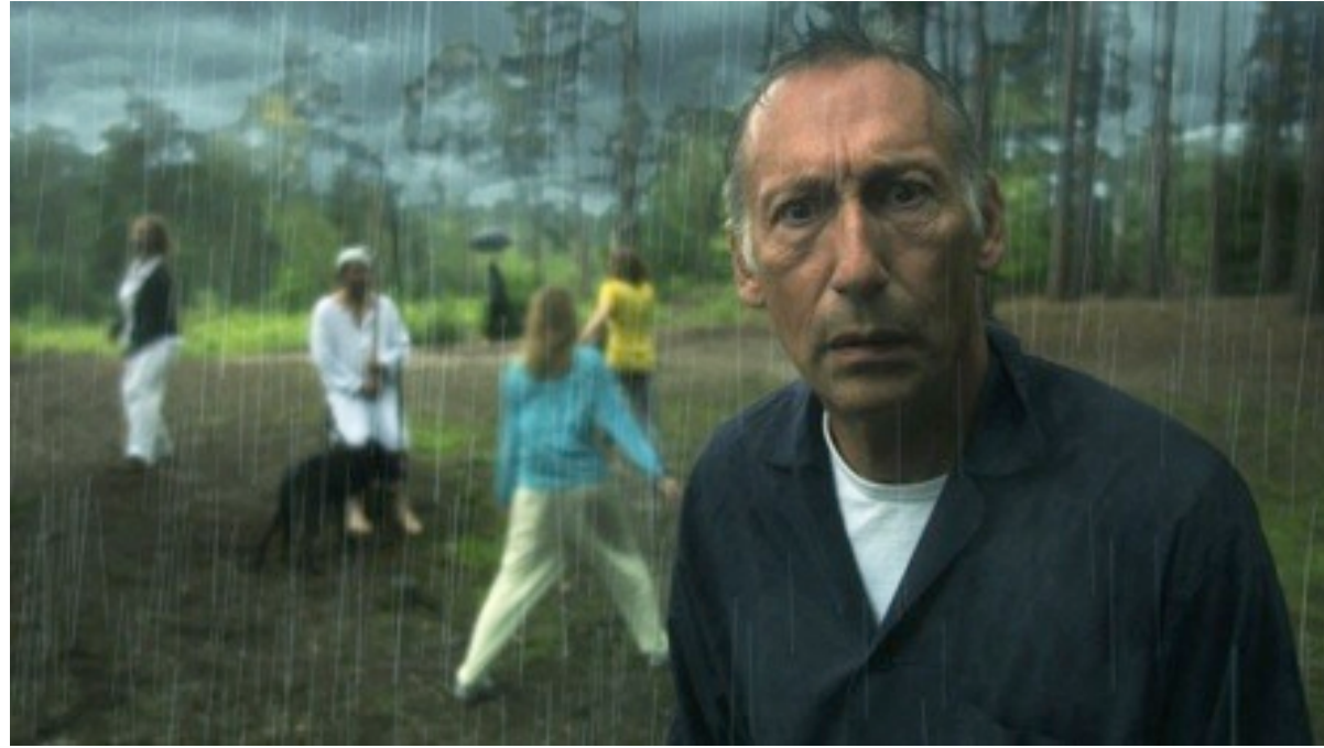
TWO TIME BAFTA WINNER CHRIS LANGHAM