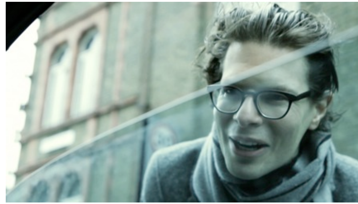
DOUBLE BRITISH COMEDY AWARD WINNER SIMON AMSTELL