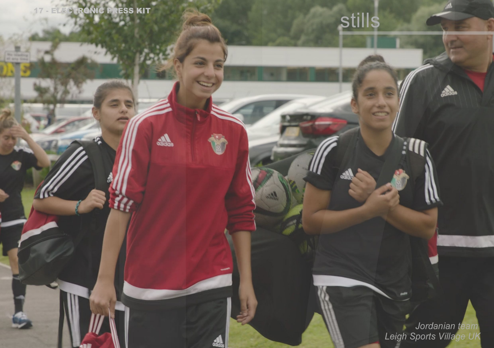
Jordanian team, Leigh Sports Village UK