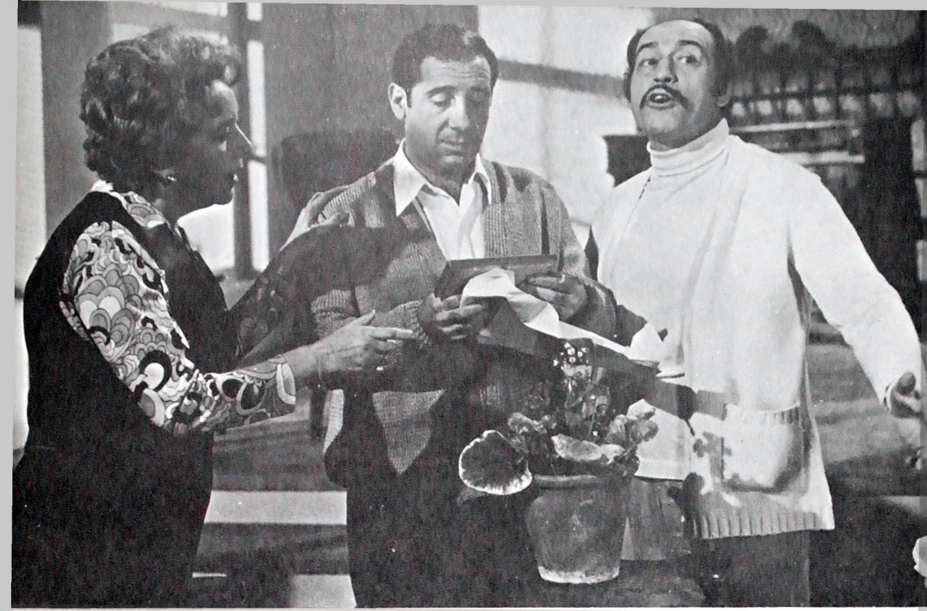
ARY CARMEN PRENDES - ALFREDO LANDA - JOSE LUIS LOPEZ VAZQUEZ