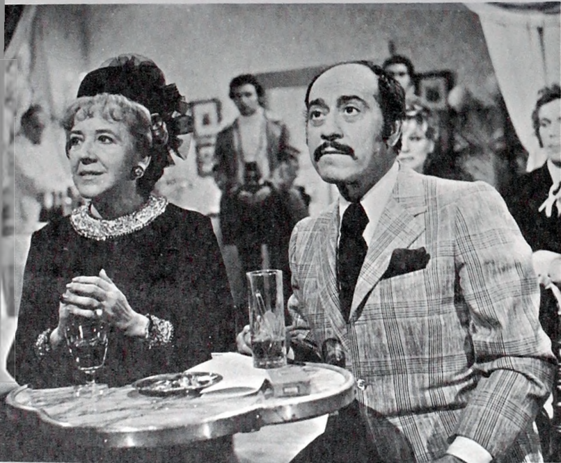
MIRTA MILLER - JOSE LUIS LOPEZ VAZQUEZ