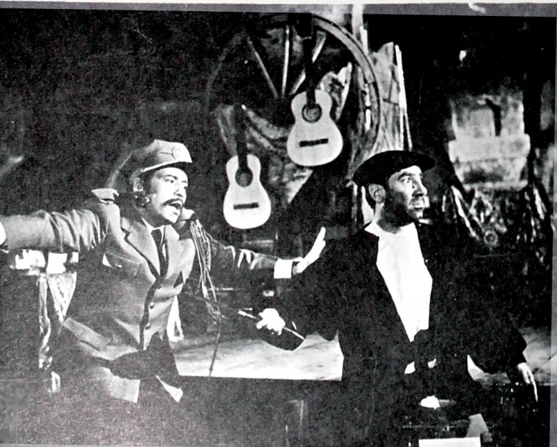
JOSE LUIS LOPEZ VAZQUEZ - ALFREDO LANDA