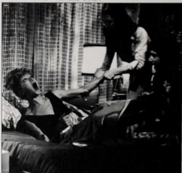
TERESA GIMPERA - CHARO LOPEZ - ALFREDO LANDA