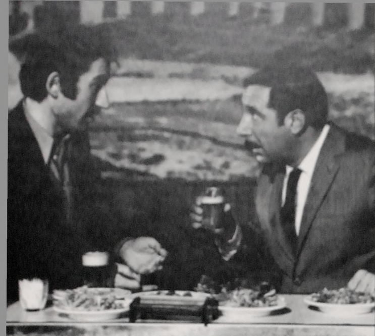
JOSE SACRISTAN - ALFREDO LANDA